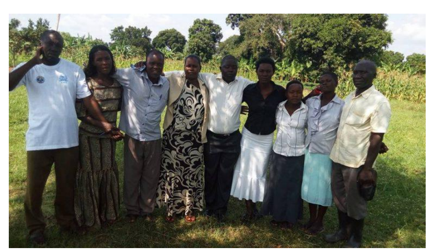
The New Classroom block up to the beam level December 2024. Teaching Staff and some of the children at the neema mission School.